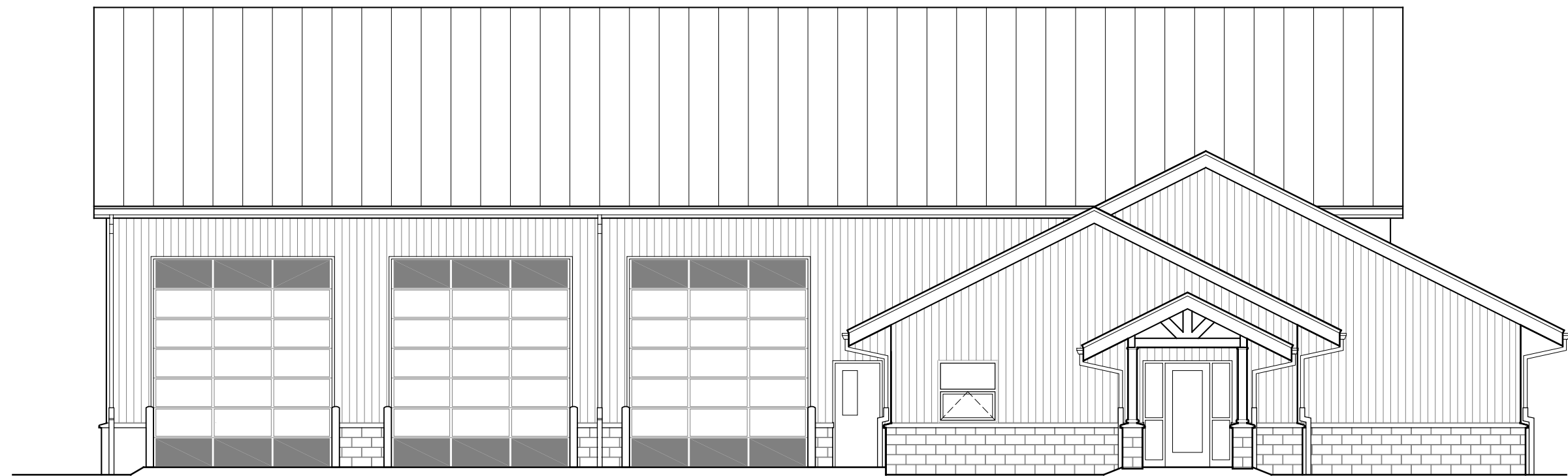
ELEVATION - New Station

15049 NE BEL/RED RD BELLEVUE, WA 98007 Fax (425) 843 4607 Tel (425) 843 3123 E-Mail: architect@cjai-inc.com